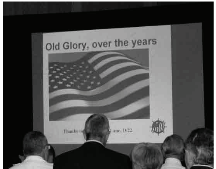
Special Tribute to Old Glory