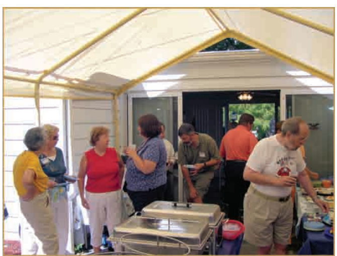
The ladies chat about the 2007 boating season