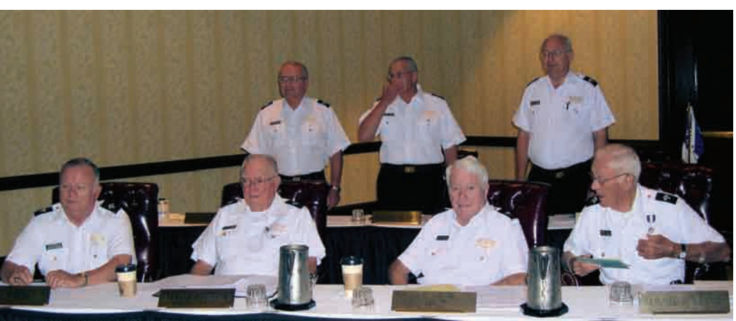
Past Chief Commanders