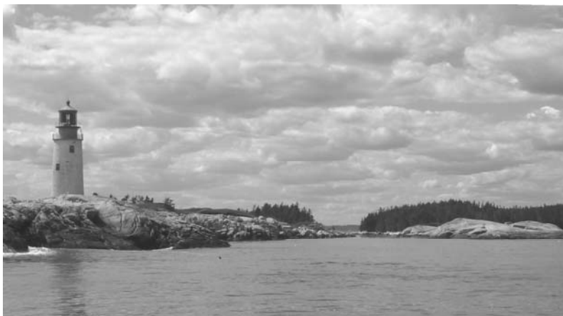
Mistake Island Light, Down East Maine

It's a little unusual for one of the speakers to be writing the Lubber's Line article about their presentation – but it was an unusual presentation to say the least. Wanting to avoid any technical glitches, I set up our laptop and the projector before the social, testing all the connections, adjusting the focus – everything worked great! So I turned everything off and unplugged the extension cord – not wanting to risk the tripping hazard as we moved our chairs around for the presentation.