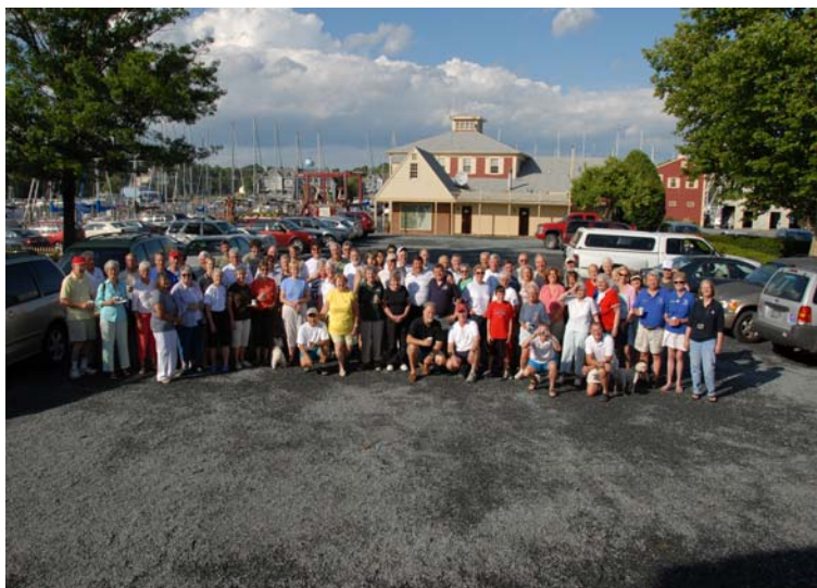
WPS members kick-off the festivities at the 2009 Annual Cruise Picnic and Commander's Reception

Thank you to everyone that participated in the 2009 WPS Cruise survey – the 2010 Cruise Committee listened to your input. There was a majority request to return to Baltimore to close the cruise and so we have arranged the last port-of-call at Baltimore Inner Harbour East (with newly completed renovations – we hope!). For anchorages we included favorites + one new anchorage, Leeds Creek. The social activities play a big role in the success of the cruise and the committee is planning something every day, including sail races and a predicted log contest.