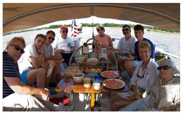
WPS members enjoying appetizers 2008 Annual Cruise

All WPS members, including new cruisers, are invited to participate in all or part of our week on the Bay. On past cruises, some of our members have chosen to join the cruise 'by land' to participate in scheduled shore activities. Our 2009 Cruise Plan will allow several opportunities for members to join by land with convenient hotel accommodations available nearby in Rock