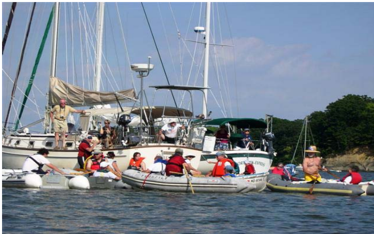
Crews line up for the start of the dinghy race