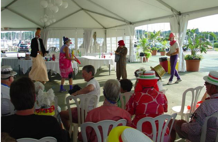
Here come the clowns