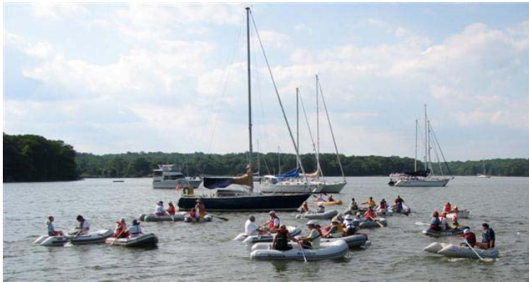
Dinghy crews get ready to race