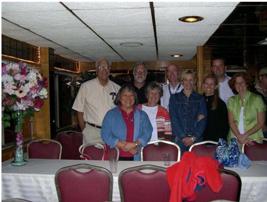
WPS members who attended the cruise

provide an enhanced educational experience. Immediately upon boarding, members of various Squadrons mingled on Ben Franklin's lower dining deck for a very satisfactory dinner. The vessel can accommodate a large crowd for dinner without us having to scramble to reuse the same space for educational purposes. Next year's cruise will more fully utilize the second deck where a very large room could accommodate navigational presentations from area Squadrons, while the top deck will continue as the prime spot to observe the heavy ship and barge traffic we encounter during the cruise.