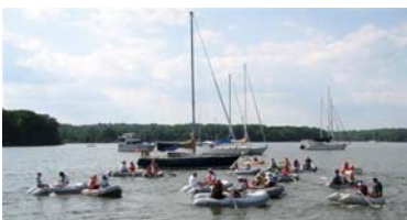
Dinghy crews get ready to race

Photos WPS Summer Cruise Pages 9 - 14, 17