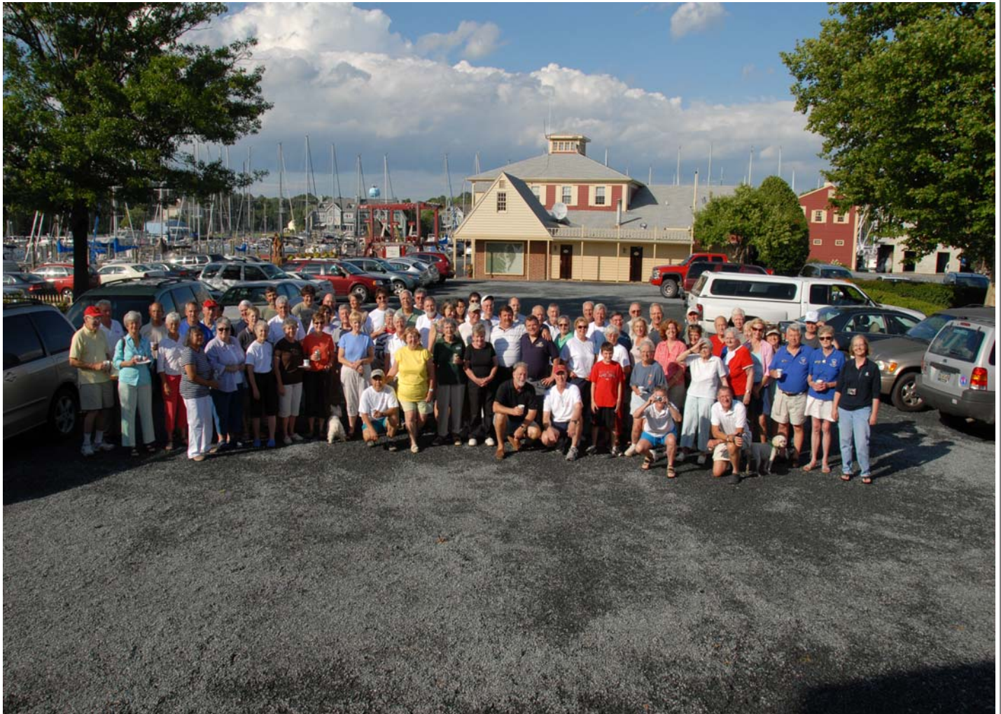
WPS members kick-off the festivities at the 2009 Annual Cruise Picnic and Commander's Reception 20 June 09