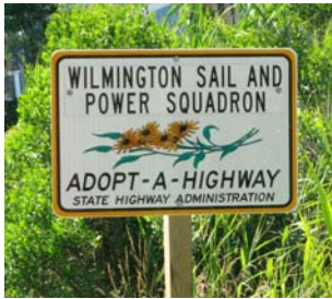
(Good sign wrong name)