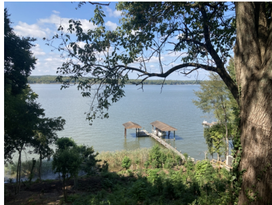
View of Elk River from Stevensons' Cottage