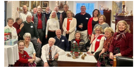
2023 Holiday Social