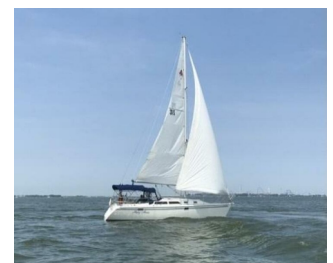
Generic Catalina 320