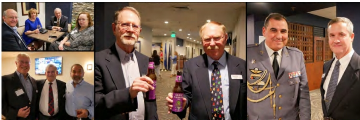
Photos from 2023 Fall Education Conference