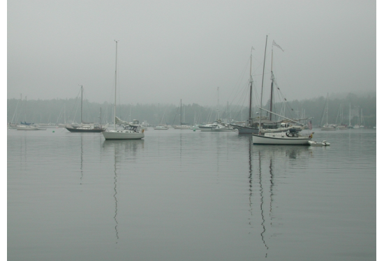
Bucks Hrbr to Camden ME