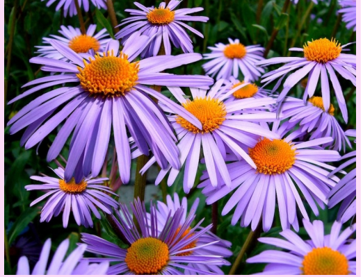
Flower of September: Aster