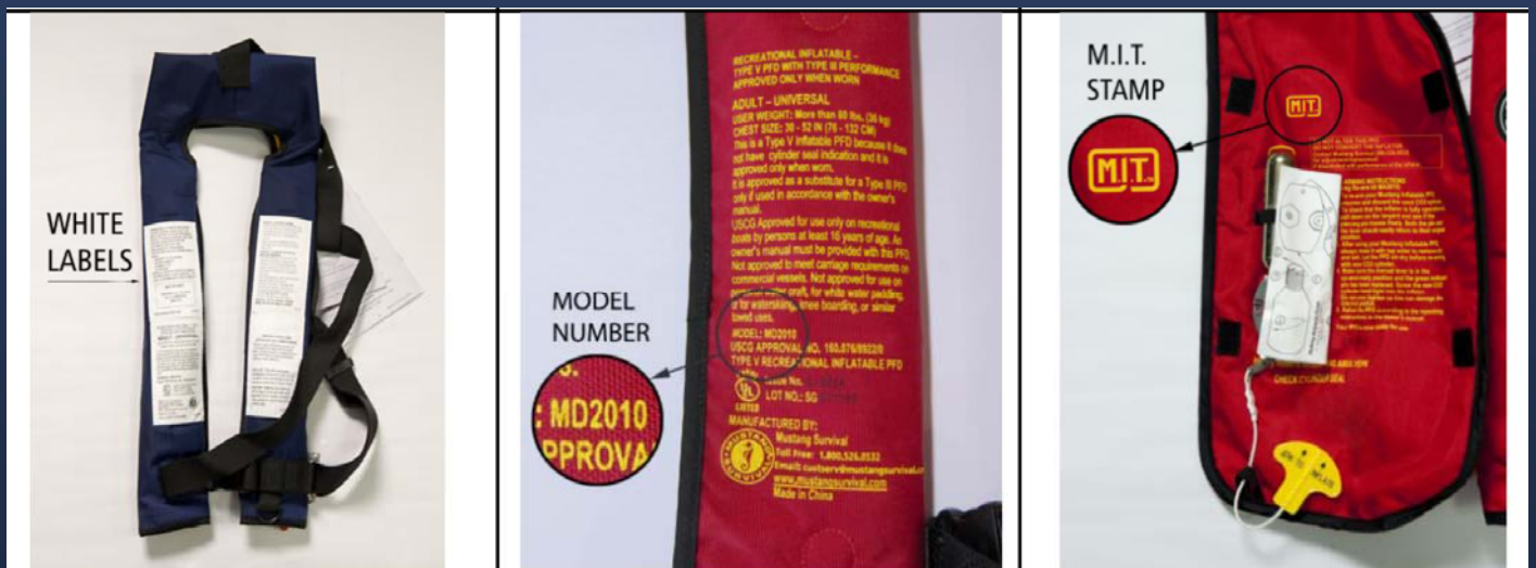
Image 3) MD2010/MD2012 models with an "MIT" ( Membrane Inflatable Technology ) stamp (in black or color) above the CO2 cylinder is OK. Any MD2010/MD2012 missing the "MIT" stamp should be returned to Mustang.

Image 2) If your inflatable does not have white sewn on safety labels, please check for model number MD2010 or MD2012 on the back of the PFD then refer to Image 3.