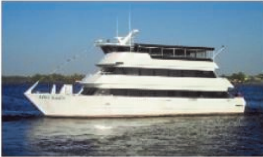
M/V Ben Franklin