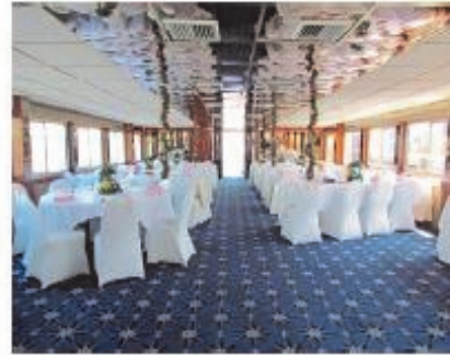
Lower Deck, Ben Franklin