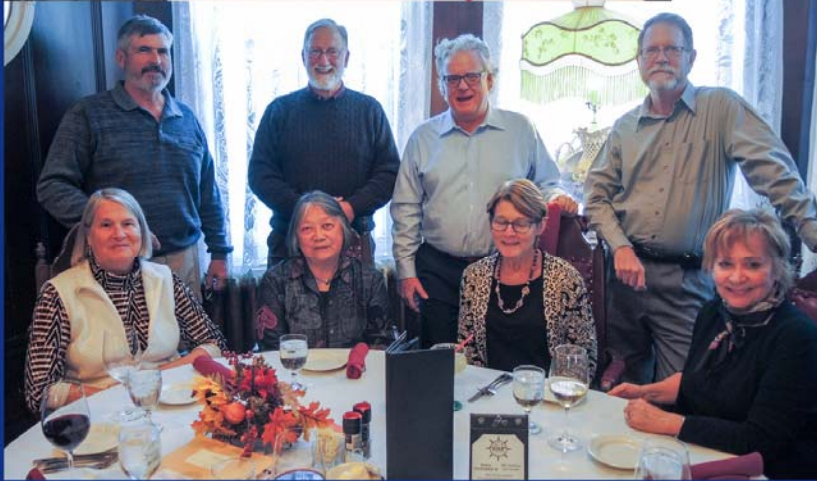
Wellwood Oyster Dinner 23 October, 2016