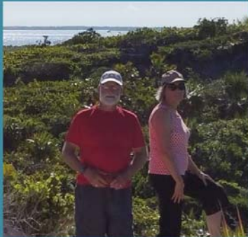
Arrived in Georgetown November 12