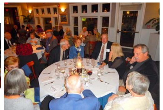
Visiting friends & family