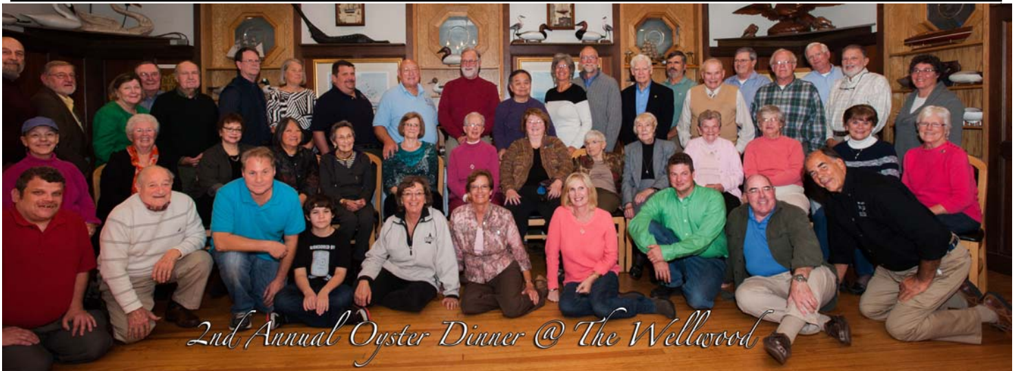
2nd Annual Oyster Dinner @ The Wellwood

The Second Annual Oyster Dinner was held again at the Wellwood Restaurant in Charlestown, MD. As you can see we had 12 more folks attending than last year and it forces us to become closer and more friendly. The food was delicious and the service delightful. We enjoyed this location!